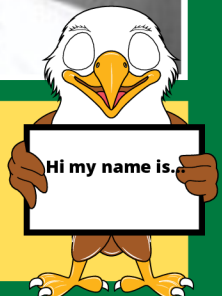
Pamelo 2 nd grade