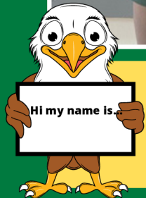
Gracie 4 th grade

Q: What's your favorite book series to read?