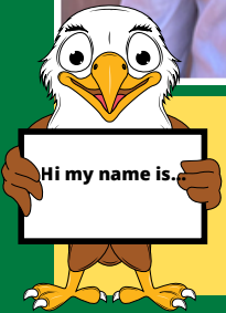
Zahara 1 st grade